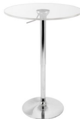
24" Diameter Glass Bistro Table