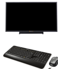
27" Desktop Monitor, Keyboard and Mouse