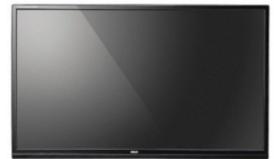
32", 43", 60" Mounted Monitor, Keyboard and Mouse

Insight Exhibits has a vast inventory of additional enhancement options. If you have a specific goal, reach out to Converge23-SponsorManager@tanium.com and let's collaborate on customizing your space!